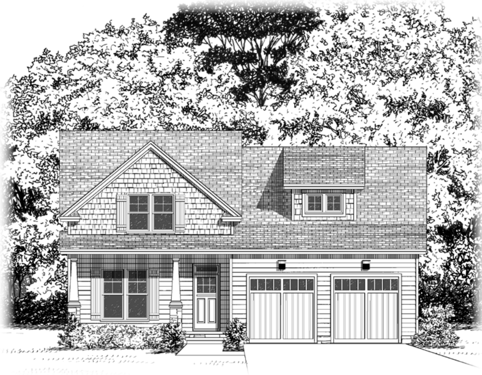
Homesite 326 ~2514 sq.ft.